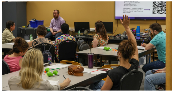
Parents take part in a Drug Free Kids Canada presentation at Timiskaming District Secondary School.

It focused on helping young people and families gain skills to have open conversations about substance use , healthy coping, and making safe decisions.