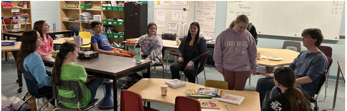
Youth participating in activities and gym time at the Floating Youth Hubs in Temiskaming Shores and Cobalt.