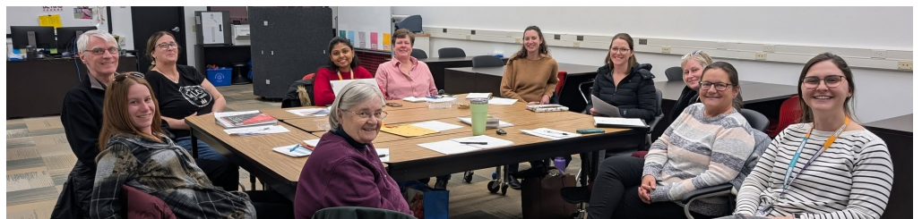
Local Action Team members meeting to discuss monthly updates of Planet Youth Timiskaming.

This year, we officially launched the Planet Youth Timiskaming website, your one-stop shop for updates, events, resources, and local survey results.