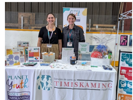
Scenes from community events where Planet Youth Timiskaming engaged with youth, families, and community members. Events pictured include the Youth Bonfire (September 2024), the Temiskaming Bike Exchange booth (June 2025), Kirkland Lake District Composite School's Mental Health Week (April 2025), and the Powwows at Timiskaming District Secondary School and for National Indigenous Peoples Day in Earlton (June 2025).