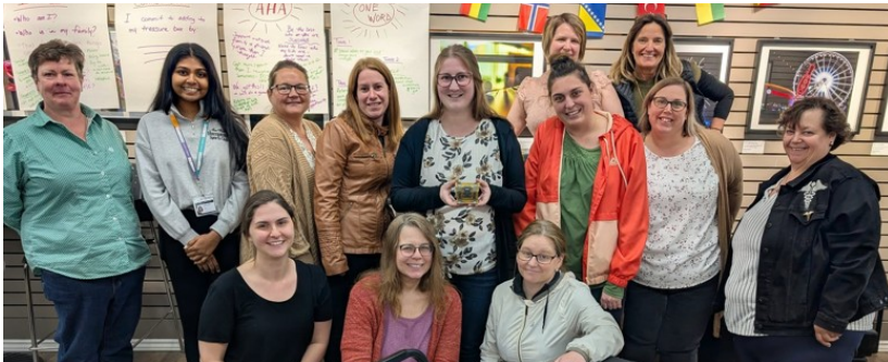
Community members take part in Parent Café host training delivered by Be Strong Families in March 2025.

Each Café has a theme and is hosted by a local parent or caregiver, with guided conversations in small groups.